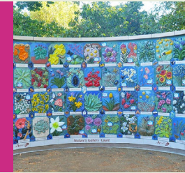
Nature's Gallery Court