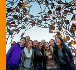
Arboretum GATEway Garden

Enjoy our renovated Arboretum Waterway and explore native plant gardens that celebrate our local natural and cultural heritage.