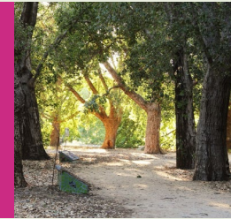
Peter J. Shields Oak Grove

Discover the diversity of habitats in the Arboretum and gather ideas for your home landscape in our valley-wise demonstration gardens.