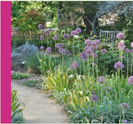
Ruth Risdon Storer Garden